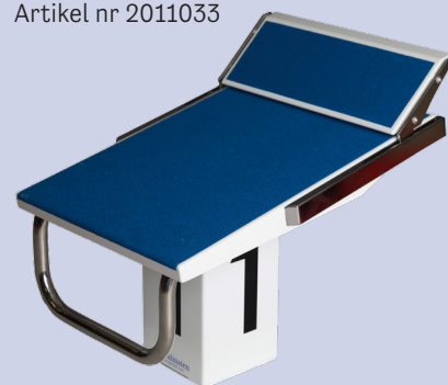
Starting block Malmsten Classic with Track Start